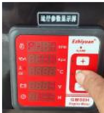
PUMP DIGITAL DISPLAY