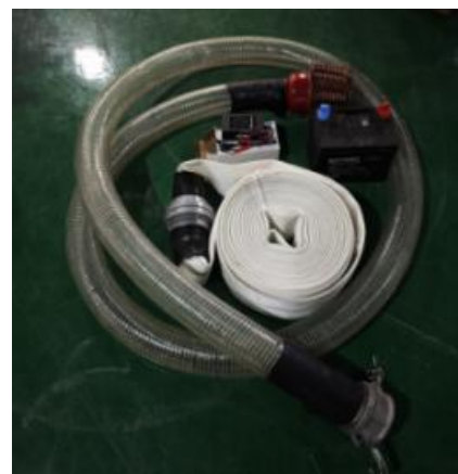
PUMP ACCESSORIES + COUPLING